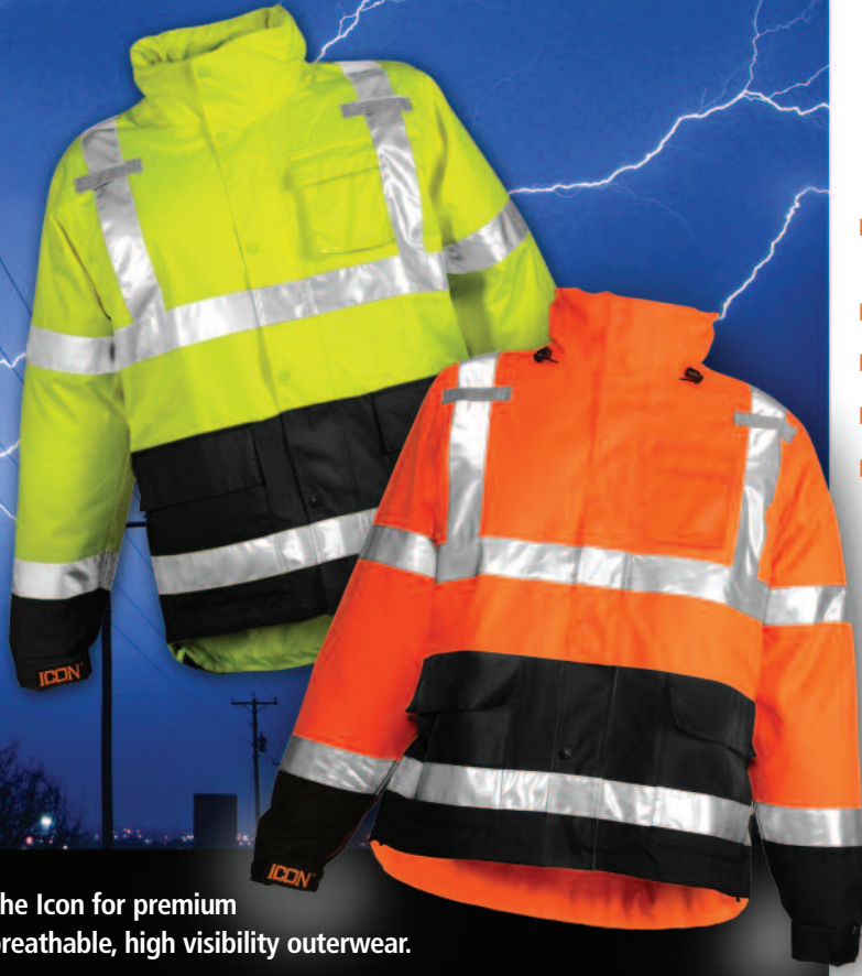
The Icon for premium breathable, high visibility outerwear.