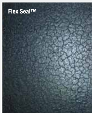
Flex Seal™ QUV 218 Hours Alligator skin; mud-cracking of surface