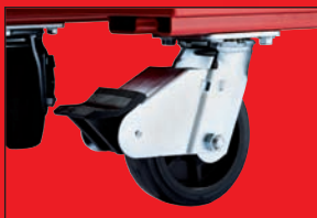
6" Casters. 2 Swivel, 2 Rigid