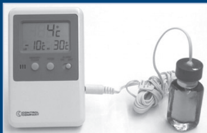
Optional Digital Thermometer Monitor With Alarm