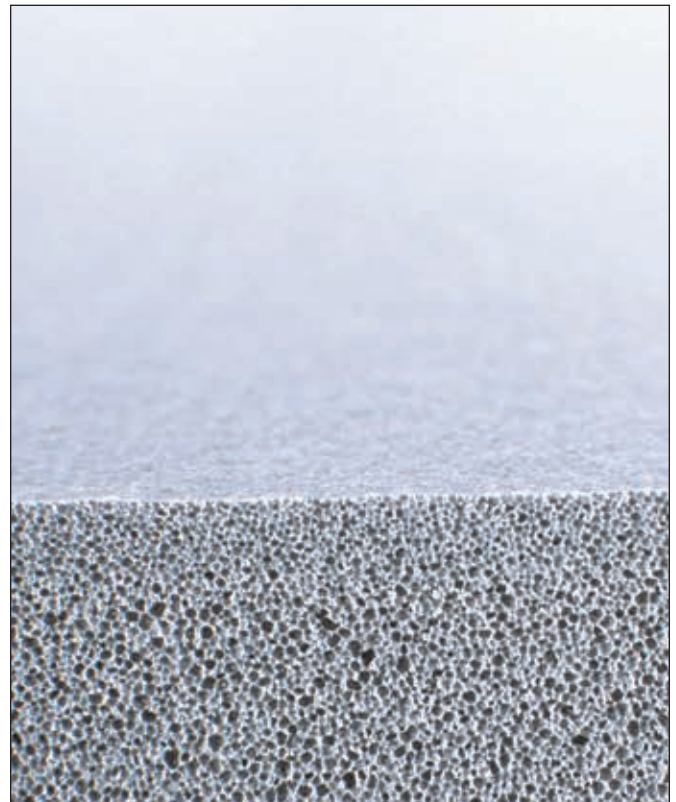
Without Dyna-Shield™ Surface