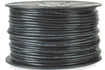
Coaxial Cable Grainger #4DNY4