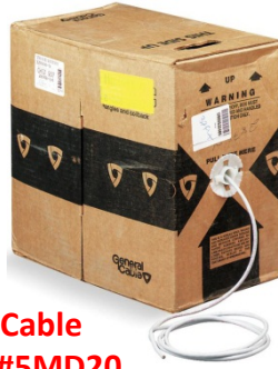
Category Cable Grainger #5MD20