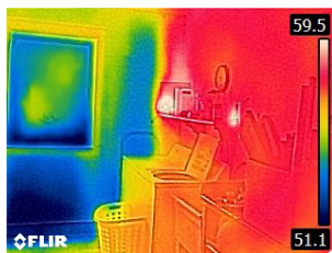
Uninsulated Outside Wall