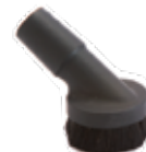
2NYE6 3 in. Plastic Round Brush Tool (use with hose only)