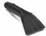
6AKY6 Claw Utility Nozzle