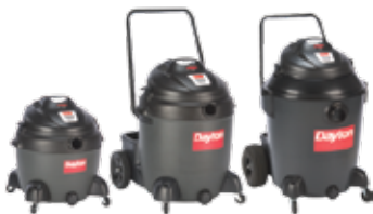
3VE21 1UG91 2RPD8