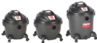
3VE18 3VE19 3VE20