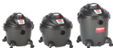
3VE18 3VE19 3VE20