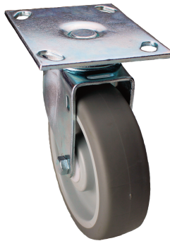
TPR Rubber Wheel Swivel

Hospital Equipment, Utility Carts, Store Fixtures, Office Equipment, Hotel Equipment, Institutional Equipment, Food Service Racks and Cases, Stock Carts, Laundry Trucks