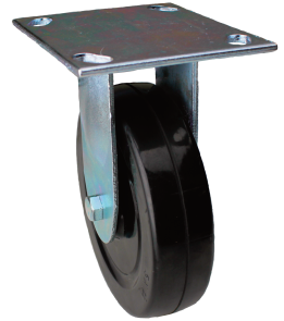
Soft Rubber Wheel Rigid

Matches Up With the ER Wagner Americaster Series