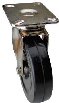
Soft Rubber Wheel Swivel

Hospital Equipment, Utility Carts, Store Fixtures, Office Equipment, Hotel Equipment, Institutional Equipment, Food Service Racks and Cases, Stock Carts, Laundry Trucks