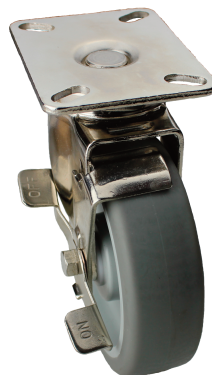
TPR Rubber Wheel Swivel w/Brake