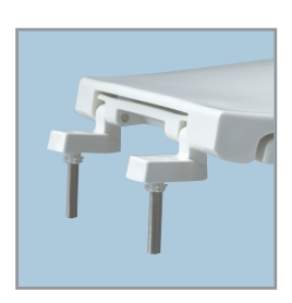
PLASTIC HINGES WITH STAINLESS STEEL POSTS AND PINTLES