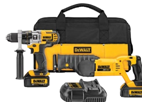
DCK292L2 11A175 20V MAX* Hammerdrill / Recip Saw Combo Kit (3.0 Ah)