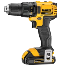
DCD780C2 11A170 Compact Drill/Driver Kit (1.5 Ah)