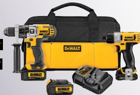
DCK294L3 11A176 20V MAX* Hammerdrill (3.0 Ah) / 12V MAX* Screwdriver Combo Kit