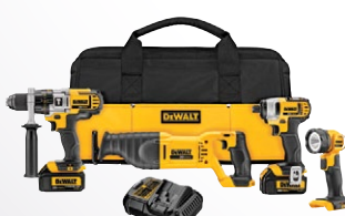
DCK490L2 11A162 20V MAX* 4-Tool Combo Kit (3.0 Ah)