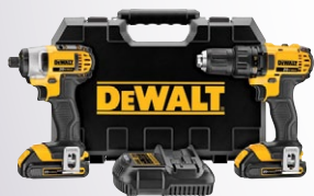
DCK280C2 11A169 20V MAX* Compact Drill/Driver / Impact Driver Combo Kit (1.5 Ah)