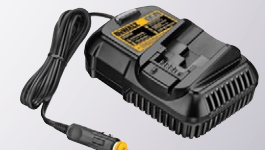
DCB119 11A158 12V MAX* - 20V MAX* Vehicle Battery Charger