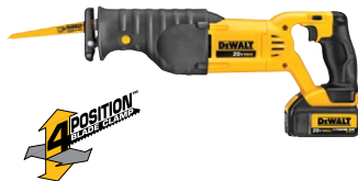
DCS380L1 11A179 Reciprocating Saw Kit (3.0 Ah)