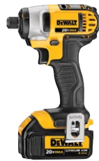
DCF885L2 11A181 1/4" Impact Driver Kit (3.0 Ah)