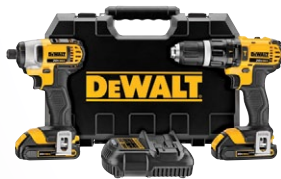
DCK285C2 11A171 20V MAX* Compact Hammerdrill / Impact Driver Combo Kit (1.5 Ah)