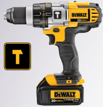
DCD985L2 11A178 Premium 3-Speed Hammerdrill Kit (3.0 Ah)