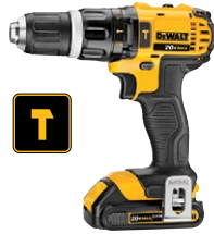
DCD785C2 11A172 Compact Hammerdrill/Driver Kit (1.5 Ah)