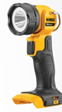
DCL040 11A159 LED Flashlight