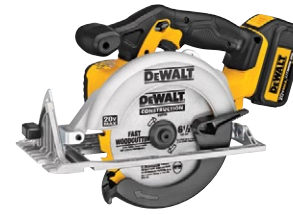
DCS391L1 11A166 6-1/2" Circular Saw Kit (3.0 Ah)