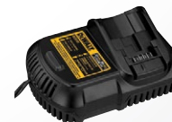
DCB101 11A157 12V MAX* - 20V MAX* Battery Charger