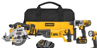
DCK491L2 11A161 20V MAX* 4-Tool Combo Kit (3.0 Ah)