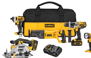
DCK590L2 11A163 20V MAX* 5-Tool Combo Kit (3.0 Ah)