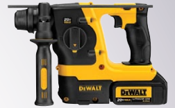
DCH213L2 11A160 3-Mode SDS Rotary Hammer Kit (3.0 Ah)