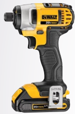
DCF885C2 11A180 1/4" Impact Driver Kit (1.5 Ah)