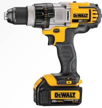
DCD980L2 11A177 Premium 3-Speed Drill/Driver Kit (3.0 Ah)