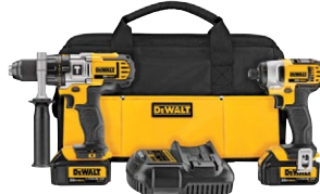
DCK290L2 11A174 20V MAX* Hammerdrill / Impact Driver Combo Kit (3.0 Ah)