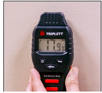
Moisture Meter (pin/pinless)