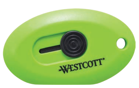
16474 Compact Magnetic Safety Cutter