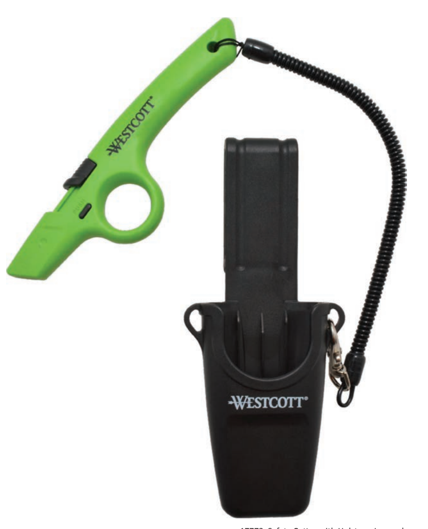
17773 Safety Cutter with Holster + Lanyard