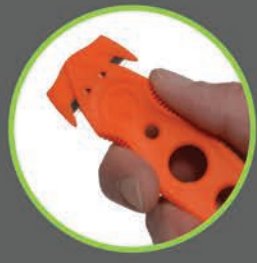
Thumb Rest For added comfort and control