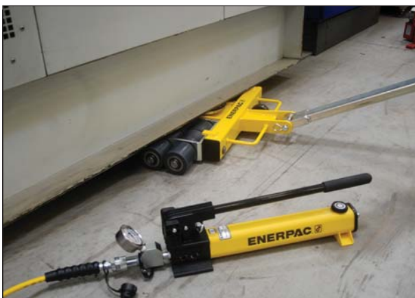
◀ An Enerpac MLS Series load skate set combined with a low height hydraulic cylinder provides the ideal package for heavy machinery moves.

Enerpac has an alternative offering of steel chain roller style load skates.