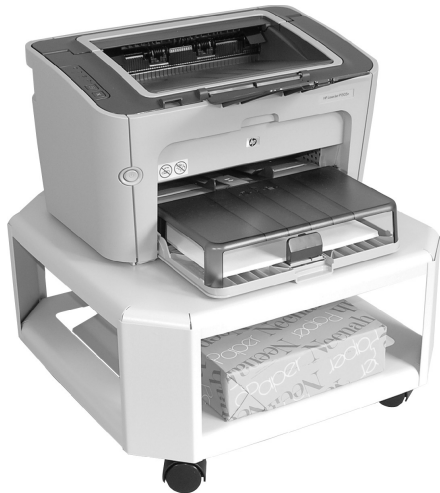
Model 24050 2 shelves