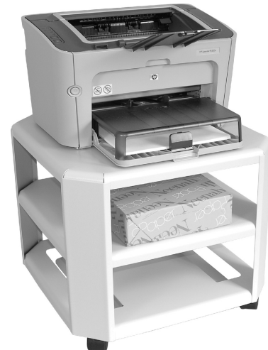
Model 24060 3 shelves

Congratulations on your purchase of the Mead-Hatcher Printer Stand. These stands are designed to help you maximize your work area by storing your printer underneath the work surface. The stands will also hold other materials like paper, documents and even personal items. The stands are equipped with two slots on the bottom shelf to hold surge protectors which you may purchase separately. You will also note there is ample room in the slots to run the power cords and other cords to make set up much easier.