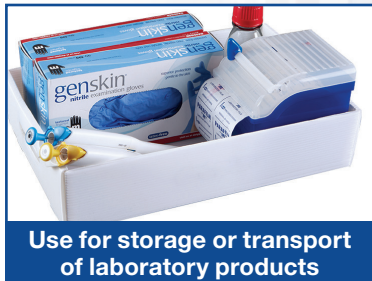
Use for storage or transport of laboratory products