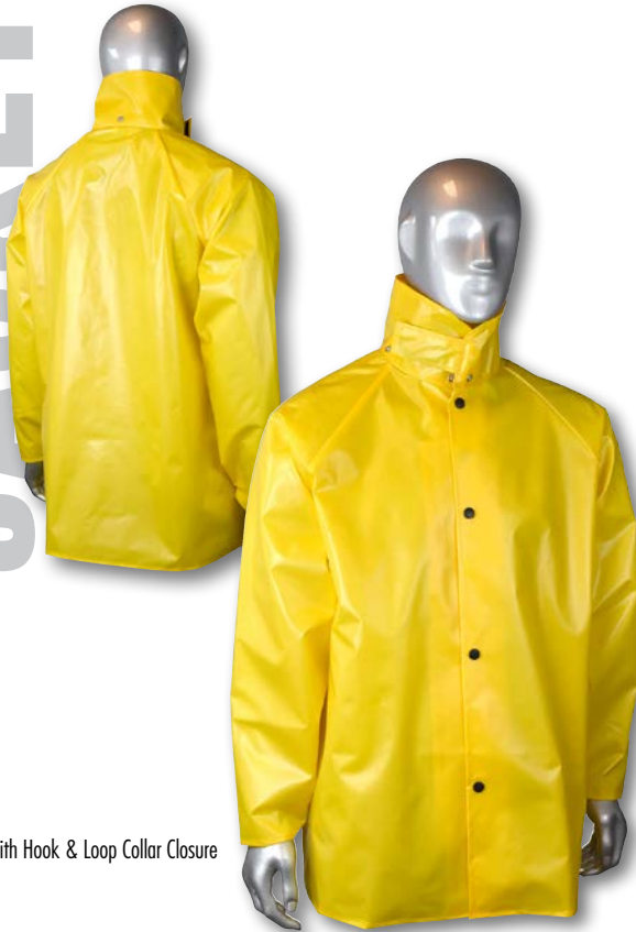
Jacket with Hook & Loop Collar Closure