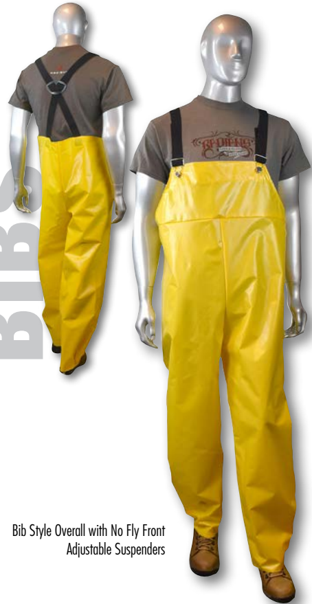
Bib Style Overall with No Fly Front Adjustable Suspenders