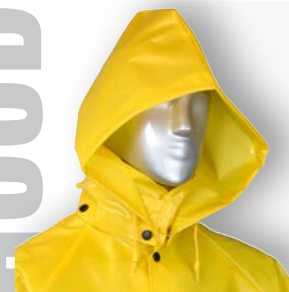
Not Included in Jacket - Sold Separately