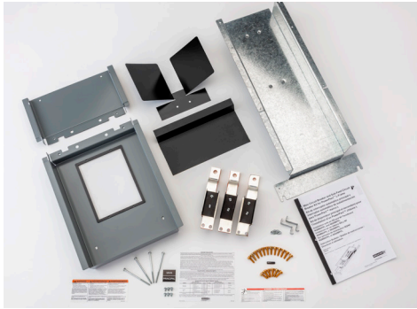
NQMB6PPL 600A Main or 400A Sub-feed PowerPact L Circuit Breaker Kit