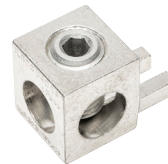
NQ100AN Lug Kit