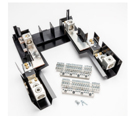
600A NQ Oversized Neutral Assembly with (6) AWG 1/0 to 750 kcmil Neutral Lugs