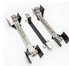
600A NQ Condo Riser Neutral Assembly