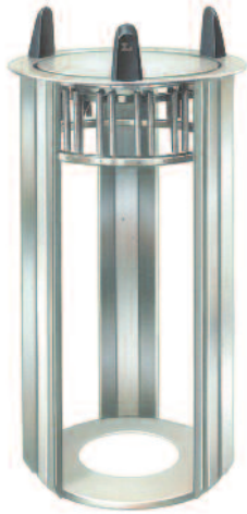
Model 400925 Open

Open, Shielded and Heated, ADA Counter Height