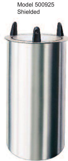
Model 500925 Shielded

Models 400025 500025 600025 400525 500525 600525 400625 500625 600625 400725 500725 600725 400825 500825 600825 400925 500925 600925 401025 501025 601025 401125 501125 601125 401225 501225 601225