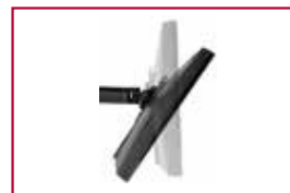
One-Touch™ tilt allows adjustment of \pm 35^\circ without the use of tools