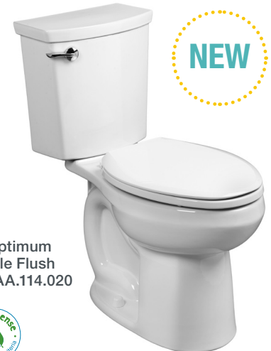
H 2 Optimum Single Flush 288AA.114.020