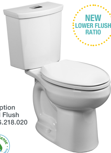
H 2 Option Dual Flush 2886.218.020