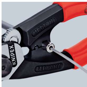
Crimping of the end caps on the Bowden cable sheath