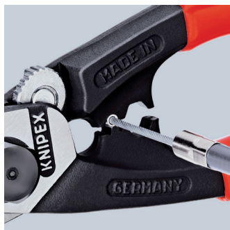
Crimping of the ferrules onto the traction cable